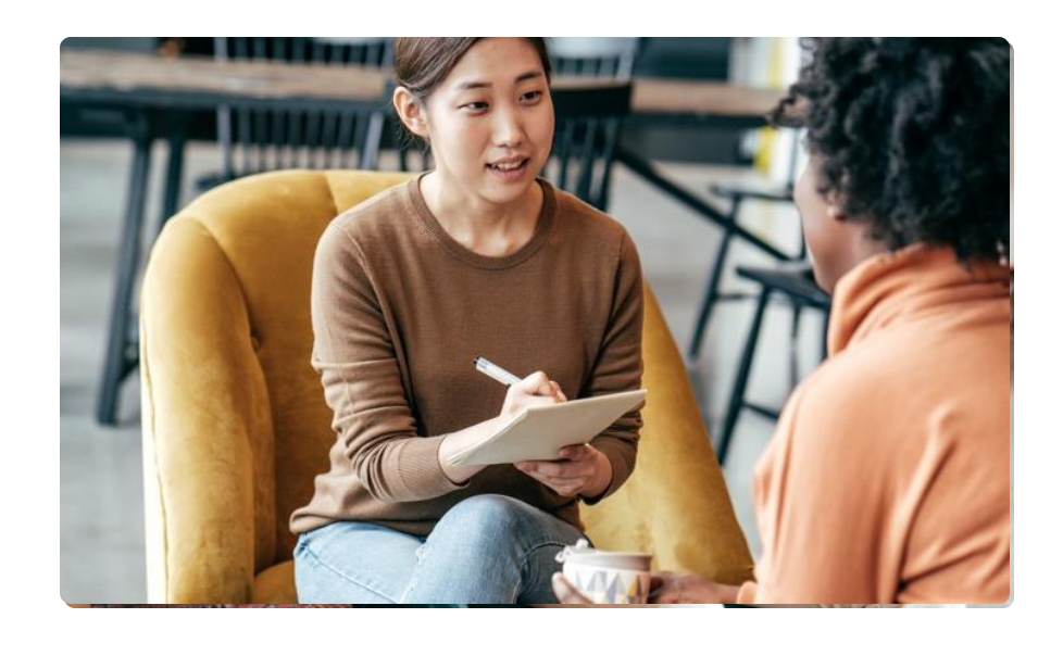
We value your feedback!