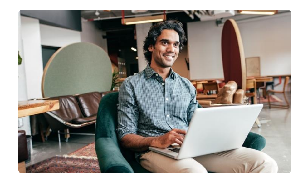
Build confidence and knowledge in our software.

Visit the question bubble in your software to find Documentation or the Help Center to find a library of help articles.